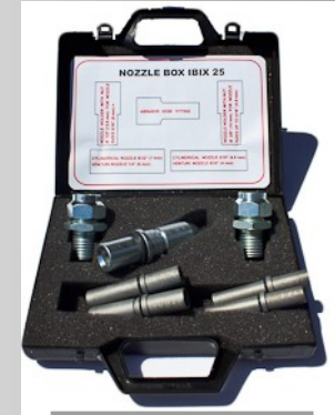
IBIX Pro 25 Nozzle Kit