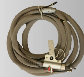
IBIX Pro 25 Gun with Hose 1" x 30'

With 5.5 mm (7/32") Tungsten Nozzle and Waternozzle With female Quick Connect for easy connec- tion to system With Rilsan Hose for air and water supply Complete with protection sheath