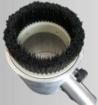
Vacuum Shroud Attachment

For low dust blasting Suitable for: IBIX Pro 3, 9 and 25