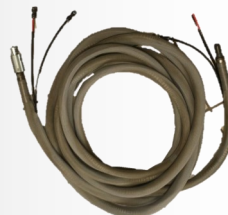
IBIX Pro 25 Extension Hose 1" x 30'

with Quick Connect female part with Quick Connect male part