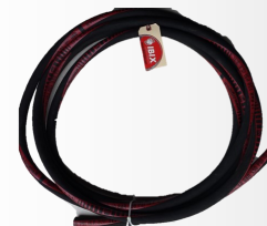
IBIX Pro 25 Abrasive Hose

with Quick Connect female part with Quick Connect male part