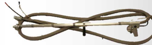
IBIX Pro 25 Lance with Hose 1" x 30'

Vortex, with Tungsten Carbide Tip 1" x 30' Hose with Quick Connect With Rilsan Hose for air and water supply Complete with protection sheath